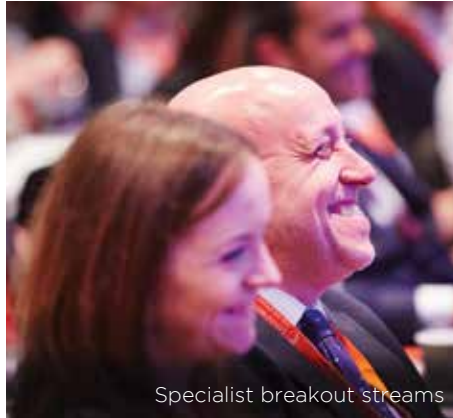
Specialist breakout streams