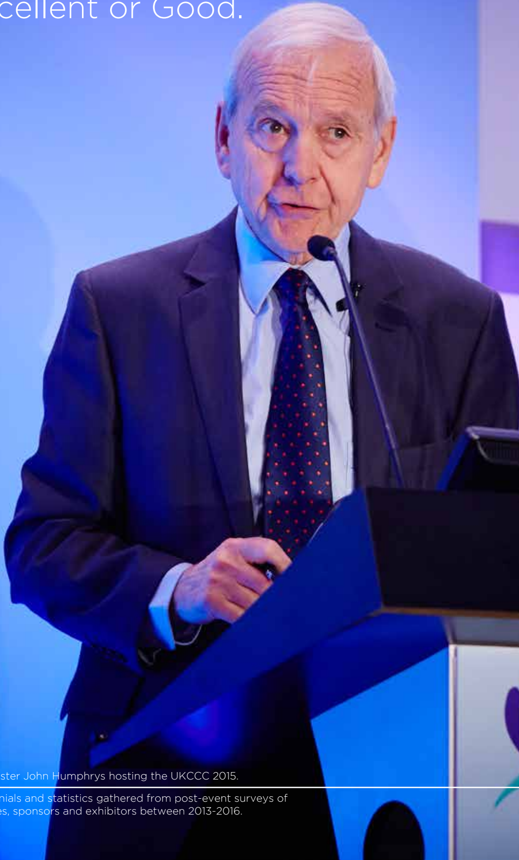
Broadcaster John Humphrys hosting the UKCCC 2015.

of delegates rated the event atmosphere as Excellent or Good.