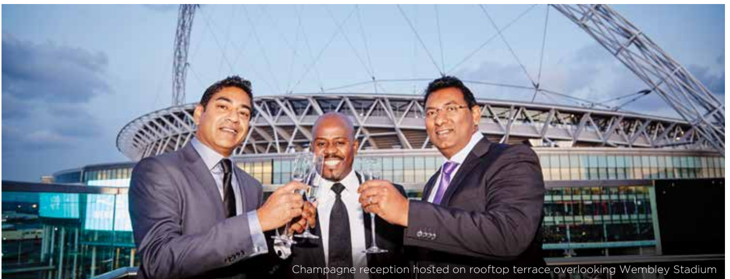
Champagne reception hosted on rooftop terrace overlooking Wembley Stadium

CHAMPAGNE RECEPTION / GALA DINNER & AWARDS INCLUDING BED & BREAKFAST