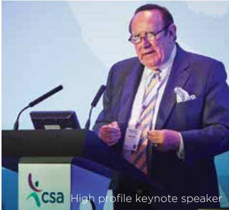
High profile keynote speaker

UK CREDIT & COLLECTIONS CONFERENCE (UKCCC)