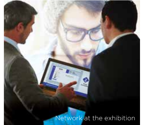
Network at the exhibition